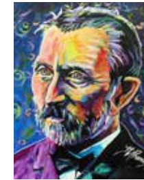
Vincent van Gogh 16" x 20" acrylic on canvas

on loan from the Taylor Donald Collection