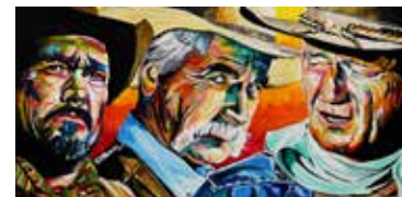
Three Hombres Ben Johnson, Sam Elliott & John Wayne 15" x 30" acrylic on canvas