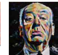
The Directors Series John Huston, Quentin Tarantino, George Lucas, Martin Scorsese, Kevin Smith, & Alfred Hitchcock acrylic on canvas