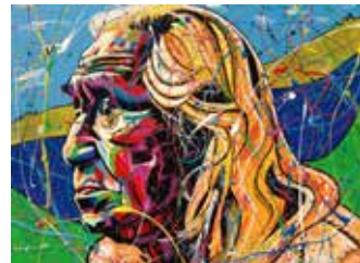
Chief Dan George 24" x 24" acrylic on canvas