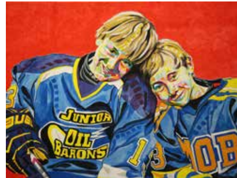
The Harty Boys 36" x 48" acrylic on canvas