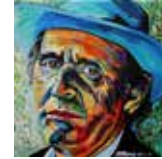
Ron Hynes 12" x 12" acrylic on canvas