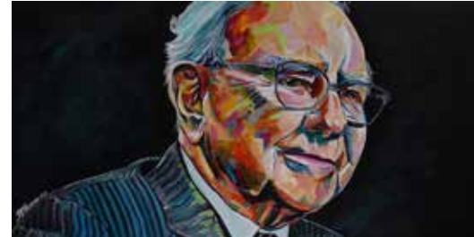
Warren Buffet 24" x 48" acrylic on canvas