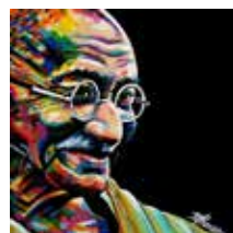
Gandi 16" x 16" acrylic on canvas