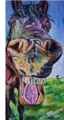
Horse of the Class 18" x 36" acrylic on canvas

Available for purchase with proceeds to the Clearwater Horse Club $750