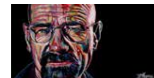
Walter White 15" x 30" acrylic on canvas