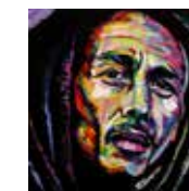
Bob Marley 16" x 16" acrylic on canvas