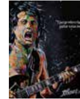
Angus Young 11" x 14" acrylic on canvas