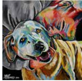
Toda and Pete 20" x 20" acrylic on canvas