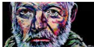
Ernest Hemingway 10" x 20" acrylic on canvas