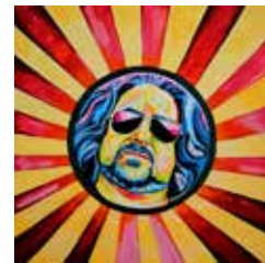
Dan Tulk 20" x 20" acrylic on canvas