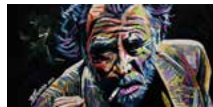
Charles Bukowski 10" x 20" acrylic on canvas