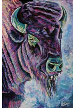
Wood Bison 24" x 36" acrylic on canvas