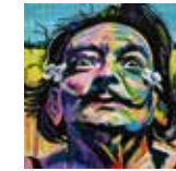
Salvador Dali 12" x 12" acrylic on canvas

on loan from the Taylor Donald Collection