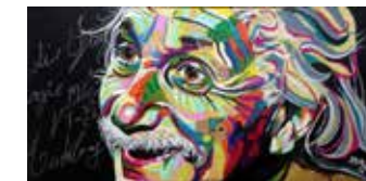
Albert Einstein 15" x 30" acrylic on canvas