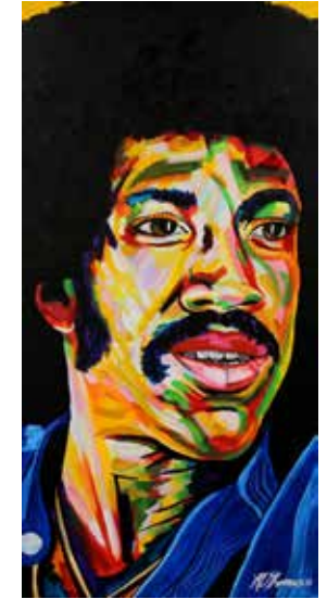
Lionel Ritchie 24" x 48" acrylic on canvas

From the Motown Lounge Collection at Northstar Ford