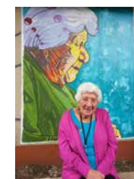
Elsie Yanik 60" x 96" acrylic on shed

Photo of the mural located in the alley between Hill and Demers Drives