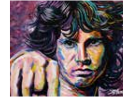
Jim Morrison 16" x 20" acrylic on canvas