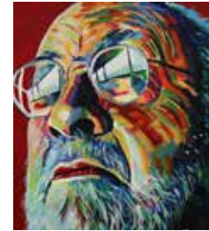
Henri Matisse 16" x 20" acrylic on canvas