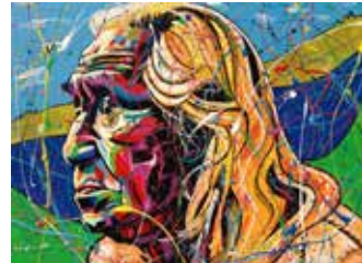
Chief Dan George 24" x 24" acrylic on canvas