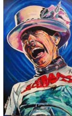
Resilience and Courage 30" x 48" acrylic on canvas