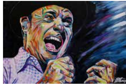
Gord Downie 24" x 36" acrylic on canvas

From the Motown Lounge collection at Northstar Ford