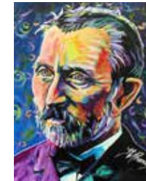
Vincent van Gogh 16" x 20" acrylic on canvas