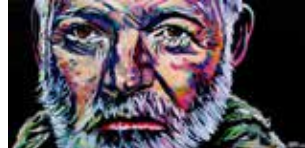
Ernest Hemingway 10" x 20" acrylic on canvas