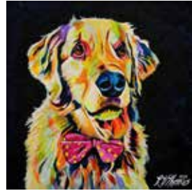
Finnigan 20" x 20" acrylic on canvas