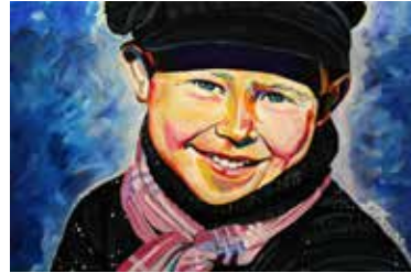
Lauren - Courage and Heart 24" x 36" acrylic on canvas