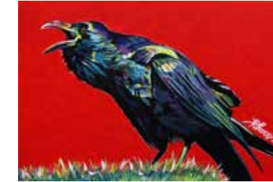
The Raven 24" x 36" acrylic on canvas