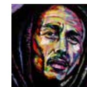
Bob Marley 16" x 16" acrylic on canvas