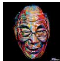
Dalai Lama 16" x 16" acrylic on canvas