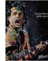
Angus Young 11" x 14" acrylic on canvas