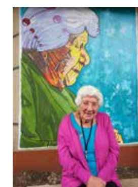
Elsie Yanik 60" x 96" acrylic on shed

Photo of the mural located in the alley between Hill and Demers Drives