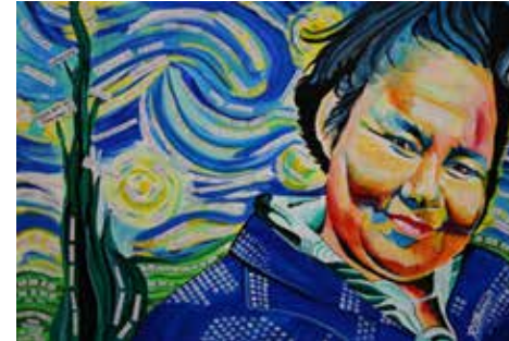
The Carla Memory Project 24" x 36" acrylic on canvas