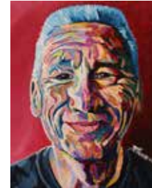
Samuel Rossi Deranger 16" x 20" acrylic on canvas