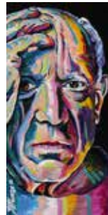
Pablo Picasso 10" x 20" acrylic on canvas