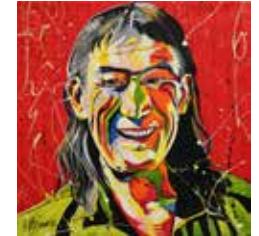
David Cardinal 20" x 20" acrylic on canvas