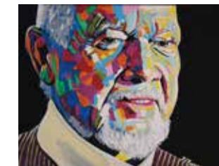
Don Cherry 18" x 24" acrylic on canvas