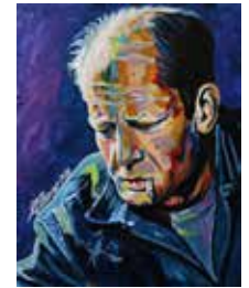
Jackson Pollock 16" x 20" acrylic on canvas