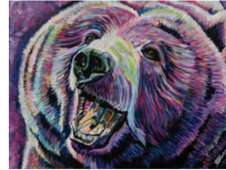
Spirit Bear 30" x 40" acrylic on canvas