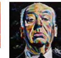
The Directors Series John Huston, Quentin Tarantino, George Lucas, Martin Scorsese, Kevin Smith, & Alfred Hitchcock acrylic on canvas