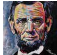
Abraham Lincoln 16" x 16" acrylic on canvas