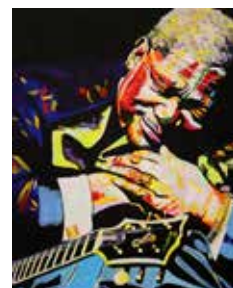
BB King 16" x 20" acrylic on canvas