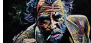
Charles Bukowski 10" x 20" acrylic on canvas