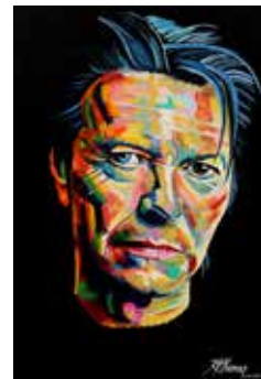
David Bowie 24" x 36" acrylic on canvas