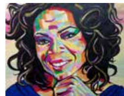
Oprah Winfrey 16" x 20" acrylic on canvas