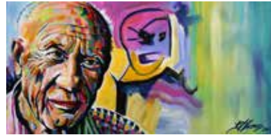
Pablo Picasso 12" x 24" acrylic on canvas