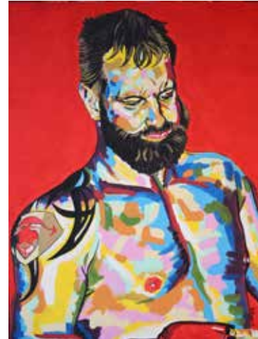
Sandy Bowman 36" x 48" acrylic on canvas