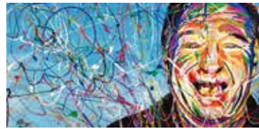
Robin Williams 12" x 24" acrylic on canvas