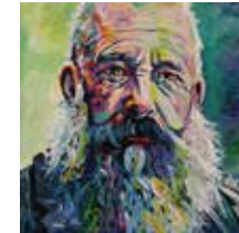
Claude Monet 12" x 24" acrylic on canvas