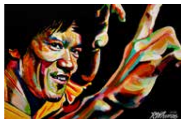
Bruce Lee 24" x 36" acrylic on canvas