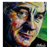
Robert De Niro 12" x 12" acrylic on canvas