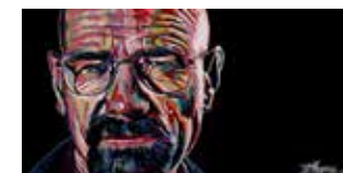
Walter White 15" x 30" acrylic on canvas