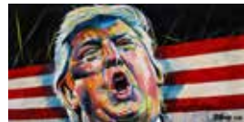
Donald J. Trump 12" x 24" acrylic on canvas