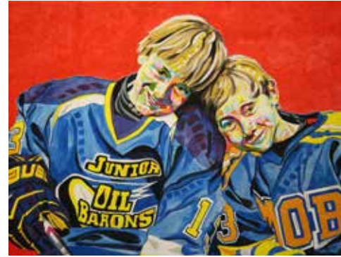
The Harty Boys 36" x 48" acrylic on canvas