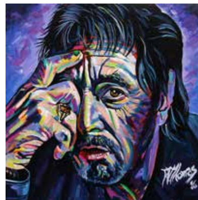
Al Pacino 24" x 24" acrylic on canvas