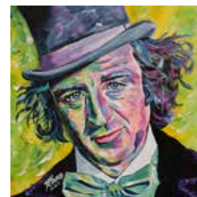
Gene Wilder 20" x 20" acrylic on canvas