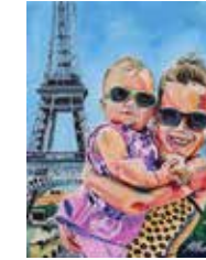
RhiAnna and Elliya 16" x 20" acrylic on canvas