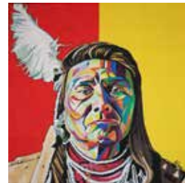
Chief Joseph 24" x 24" acrylic on canvas