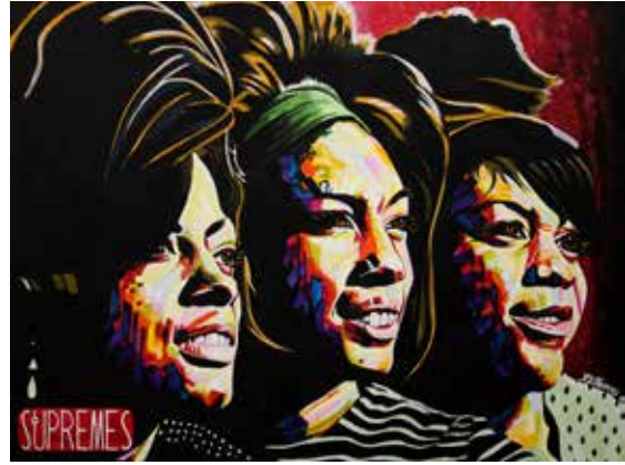
The Supremes 36" x 48" acrylic on canvas

From the Motown Lounge collection at Northstar Ford