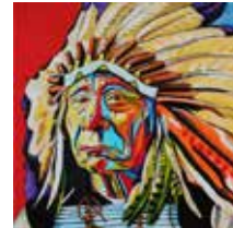
Chief Red Cloud 20" x 20" acrylic on canvas