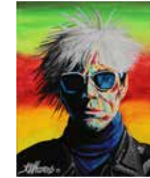
Andy Warhol 24" x 36" acrylic on canvas