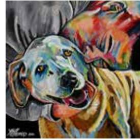
Toda and Pete 20" x 20" acrylic on canvas