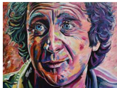
Gene Wilder 36" x 48" acrylic on canvas