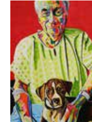
Mike Paskal 18" x 24" acrylic on canvas