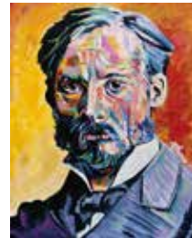
Auguste Renoir 16" x 20" acrylic on canvas