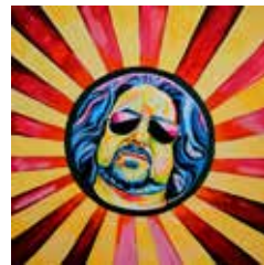
Dan Tulk 20" x 20" acrylic on canvas