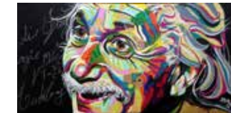
Albert Einstein 15" x 30" acrylic on canvas