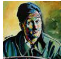
Baltus 16" x 16" acrylic on canvas