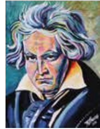
Beethoven 12" x 18" acrylic on canvas