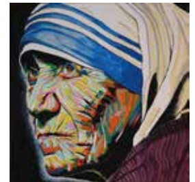
Mother Theresa 24" x 24" acrylic on canvas