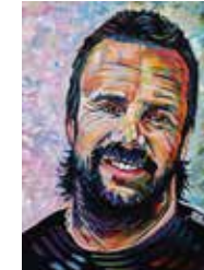
Marty Giles 18" x 24" acrylic on canvas