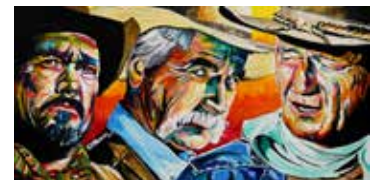
Three Hombres Ben Johnson, Sam Elliott & John Wayne 15" x 30" acrylic on canvas