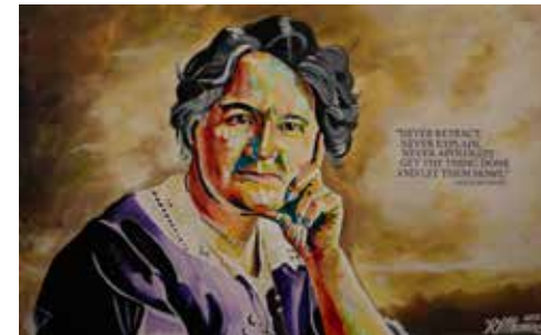
Nellie McLung 36" x 48" acrylic on canvas