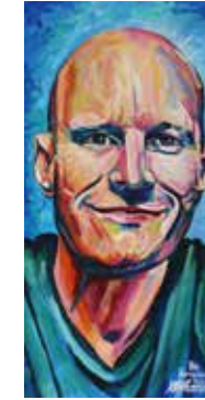
Bo Cooper 18" x 36" acrylic on canvas