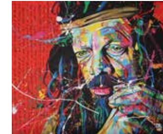
Bruno 20" x 24" acrylic on canvas