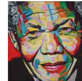
Nelson Mandela 20" x 20" acrylic on canvas