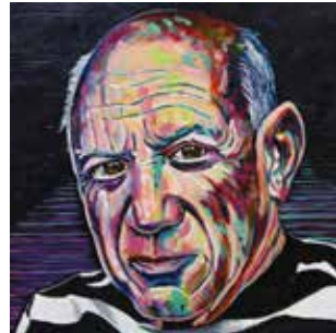
Pablo Picasso 20" x 20" acrylic on canvas