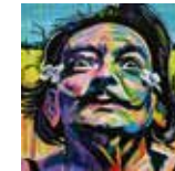
Salvador Dali 12" x 12" acrylic on canvas

on loan from the Taylor Donald Collection