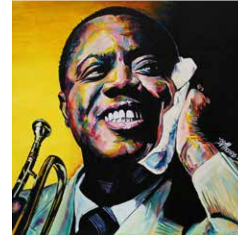
Louis Armstrong 24" x 24" acrylic on canvas