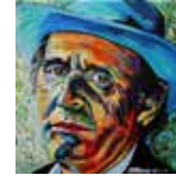
Ron Hynes 12" x 12" acrylic on canvas