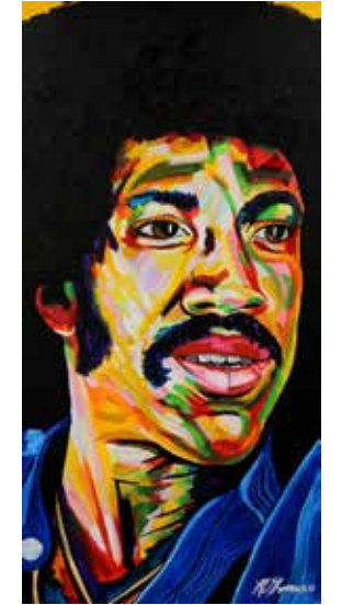
Lionel Ritchie 24" x 48" acrylic on canvas

From the Motown Lounge Collection at Northstar Ford