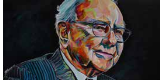
Warren Buffet 24" x 48" acrylic on canvas