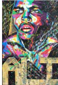
Ali 24" x 36" acrylic on canvas