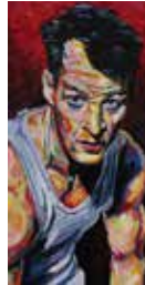
Gordie Howe 12" x 24" acrylic on canvas