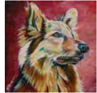
Mac 12" x 12" acrylic on canvas