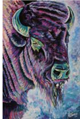
Wood Bison 24" x 36" acrylic on canvas