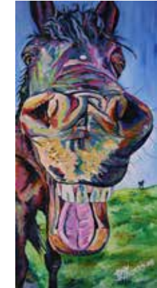
Horse of the Class 18" x 36" acrylic on canvas

Available for purchase with proceeds to the Clearwater Horse Club $750